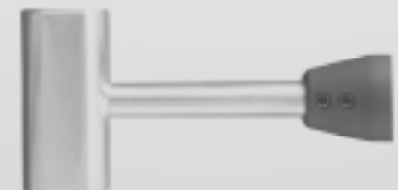
BERGMANN 198 mm - 8" 31,75 mm Ø - 340 g tk 24428-31