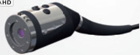
TEKNO CAM 4300 UHD